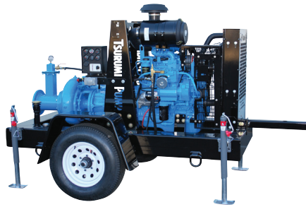
EPT4-150DPJD: Priming assisted