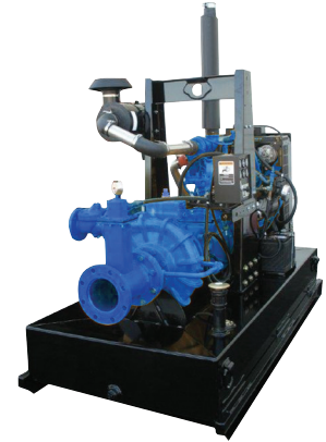
EPT4-150DPSJD: Skid mount priming assisted