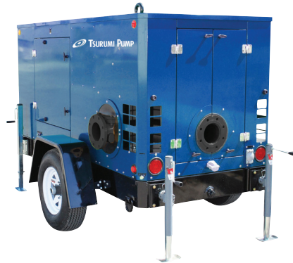
EPT4-150DPQJD: Sound attenuated priming assisted