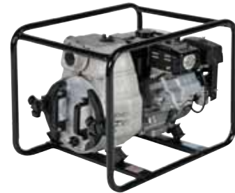
Robin Subaru EPT3-50RX